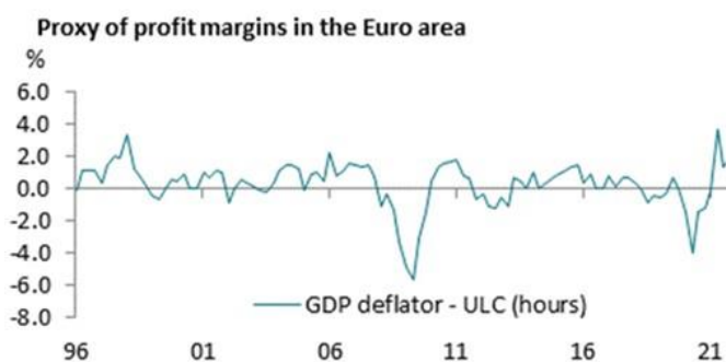
Exhibit 1 – Margins are plentiful – but it’s mostly a mechanical rebound